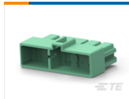
TE Part # 172137-4 FF 250 REC HSG 10P NYLON NAT